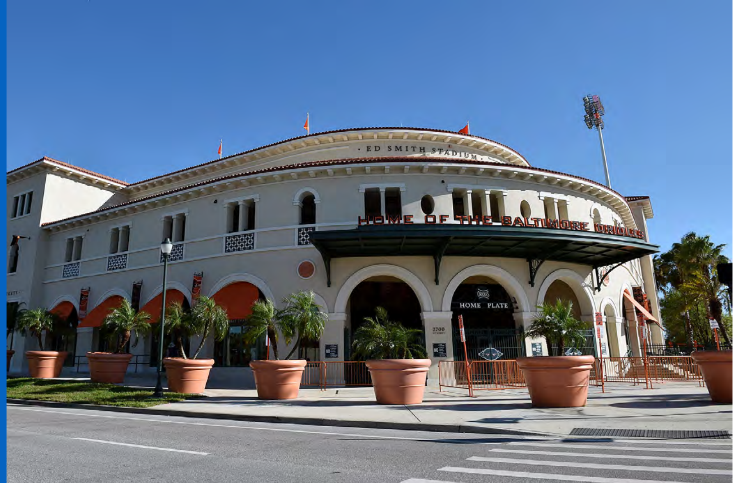
Ed Smith Stadium: Baltimore Orioles Spring Training