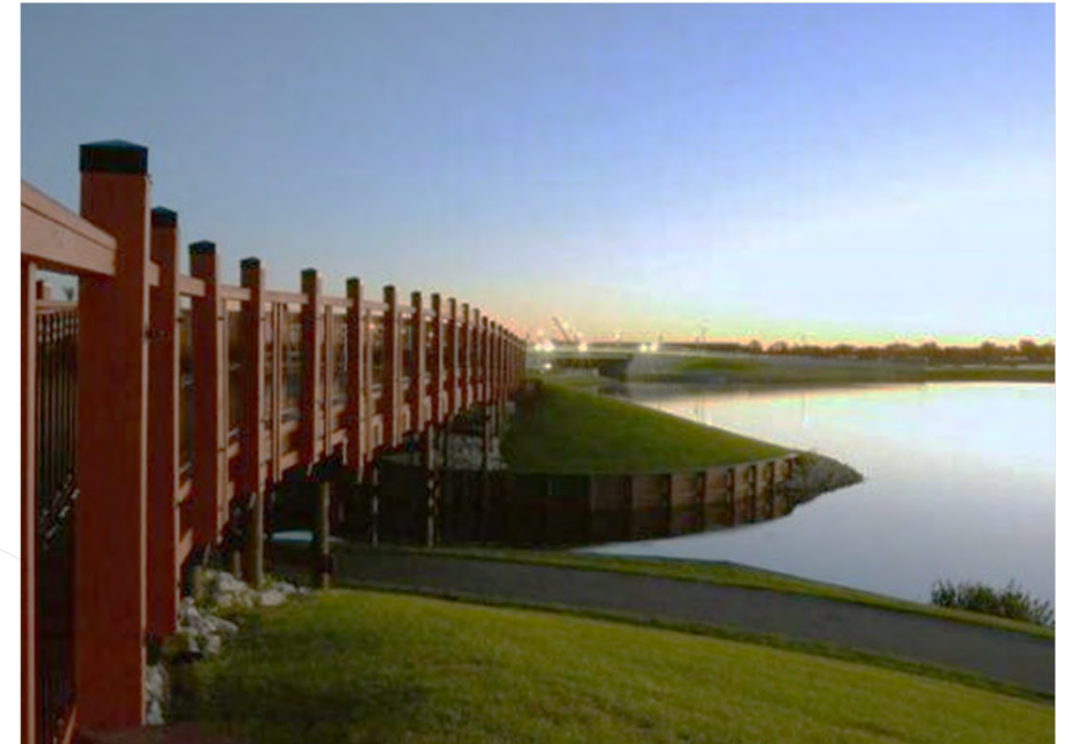
Nathan Benderson Park