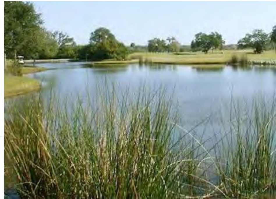
Bobby Jones Golf Course